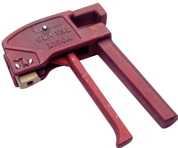
X130A Pneumatic three-way valve

The Model X134H Deadman Control is designed for use with aviation fuel. It utilizes a two-way valve with a balanced piston which is spring loaded to be normally closed. When the Model X134H is activated, the valve connects the supply hose to the outlet hose. When the lever is released, the Model X134H closes off the supply hose. The X134H Deadman Control maintains pressure in the outlet hose when the Deadman Control is closed.